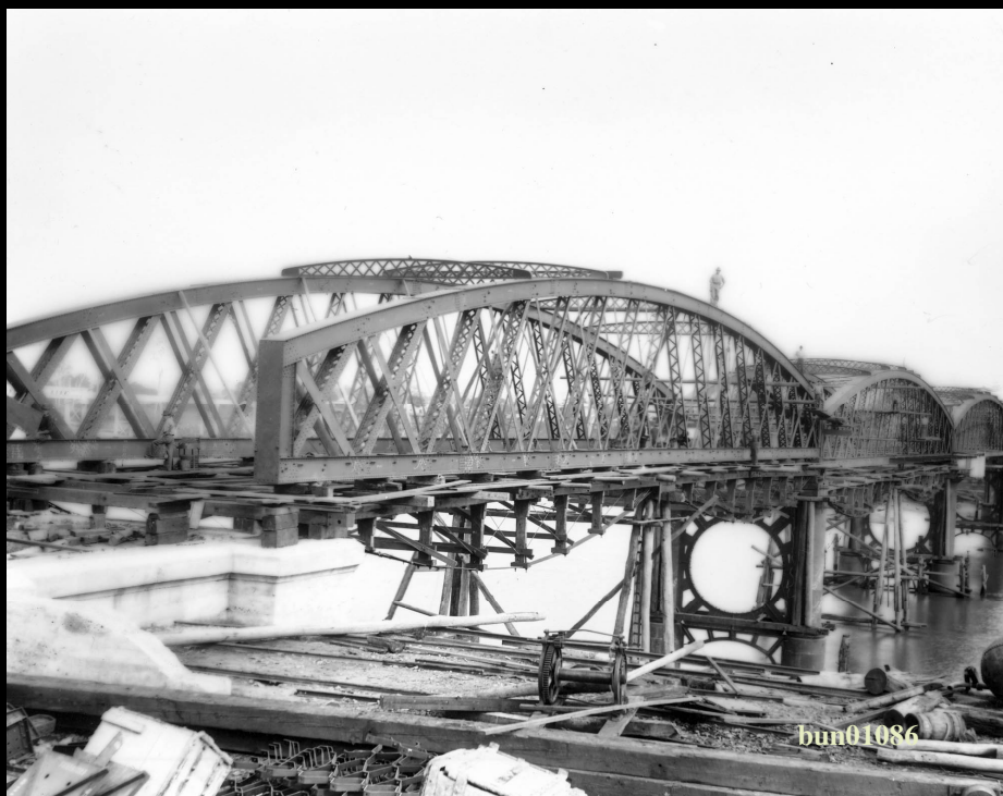
Early 1900—The bridge nears completion—built at an estimated cost of £200,000, residents originally wanted to call it Stuart Bridge, or Watson Bridge.