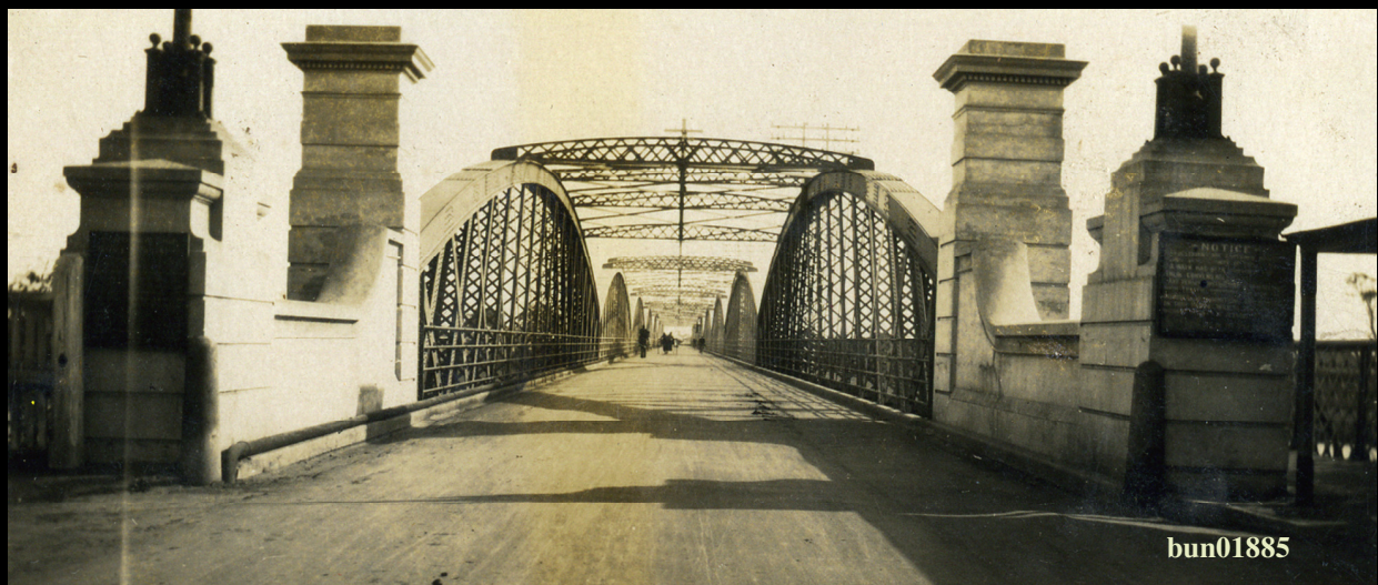
The Burnett Traffic Bridge opened on August 24, 1900, with a public holiday for local residents. Queensland Governor Lord Lambert officially opened the bridge, with Premier Robert Philp were in attendance .