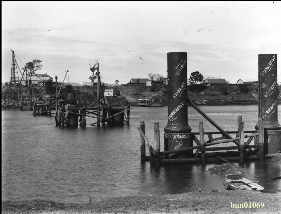
Ca 1898—Construction of the Burnett River Bridge begins—it will be the longest steel traffic bridge in Australia on completion.