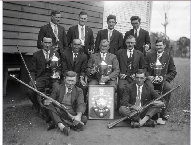
Cordalba Rifle Club