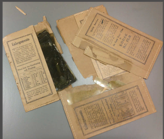
Damaged slides and negatives from the Collection