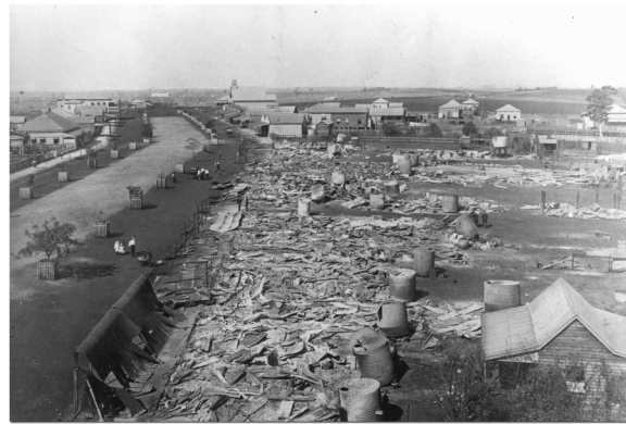
bun00731 Childers after 1902 fire

In 1909 an upper floor was added to Gaydon's building which included an adjoining shop. The upper floor was well lit and was the perfect situation for its use as a dental surgery by Thomas