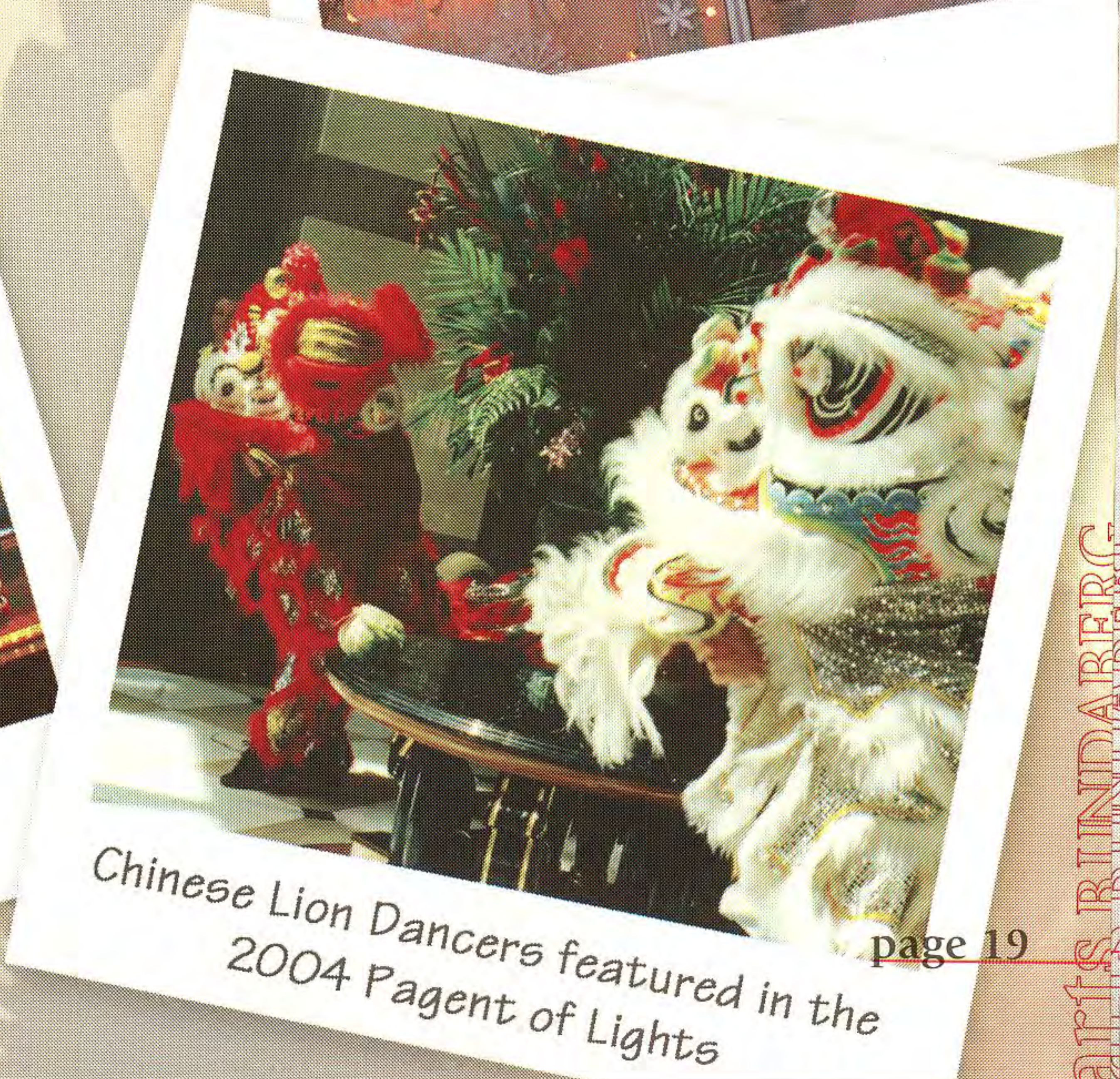
Chinese Lion Dancers featured in the 2004 Pageant of Lights